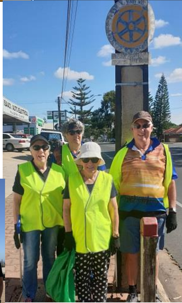
Images show some of the wonderful members of The Rotary Club of Glenelg out and about, clearing up litter at the end of January