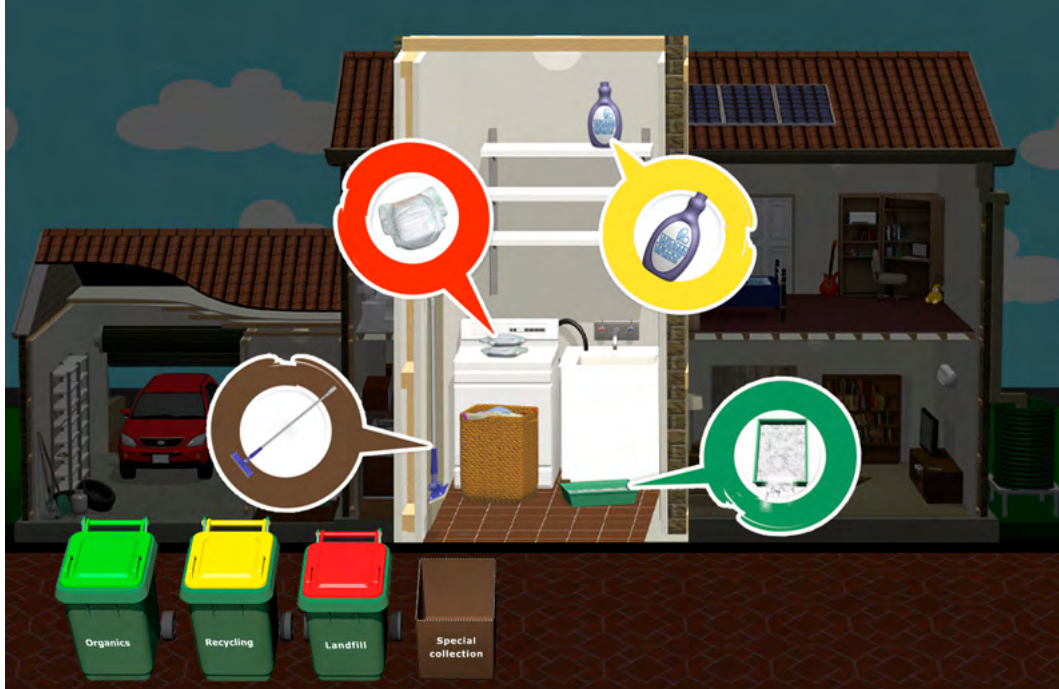
In the laundry there are four items: a mop, a single-use nappy, a laundry liquid bottle and kitty litter.