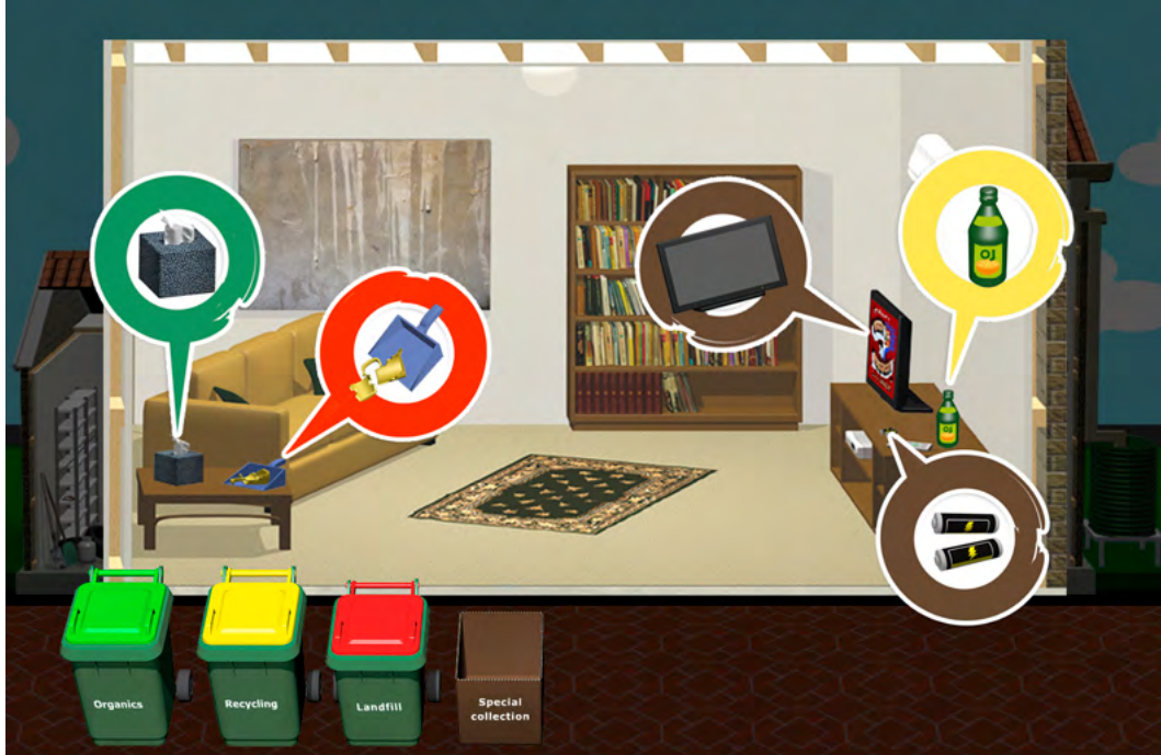
In the lounge there are five items: a used tissue, a broken ceramic cup, a TV, a glass bottle and some batteries.