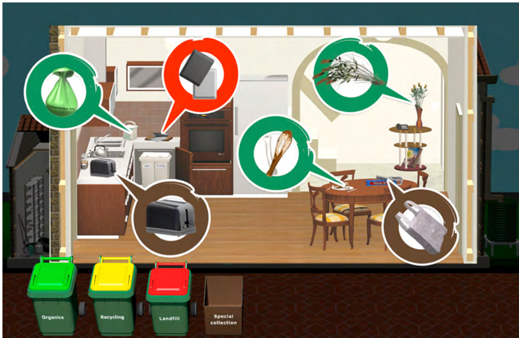
In the kitchen there are six items: a compostable bag, some foam trays, a toaster, a meaty bone, a bunch of flowers and a plastic bag.