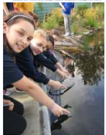
Alberton students inspect fish in their new home