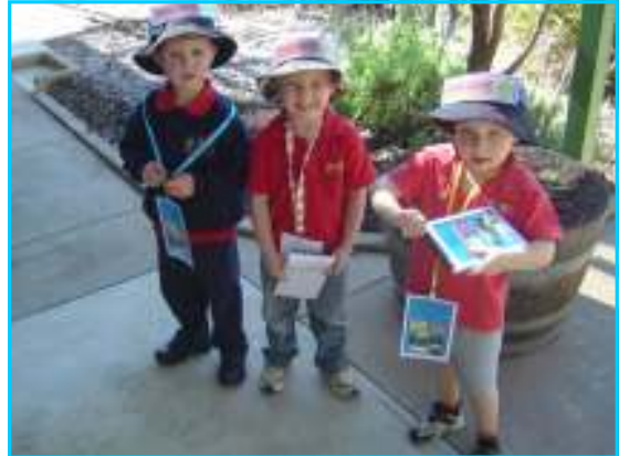
My tour guides at the Loxton Preschool Centre—where they are teaching children from a very young age the importance of sustainability, through recycling, water usage and sustainable gardening.