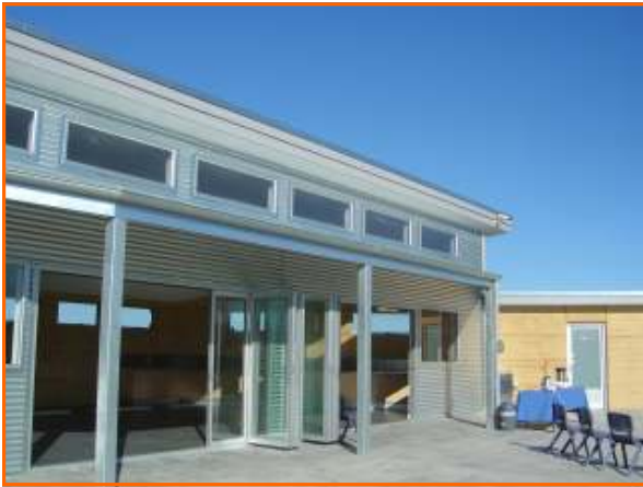
Investigator College— Sustainable Living Ecocentre at Currency Creek. Runs on solar power, uses a geothermal heat exchange system, solar passive design—just to name a few of its features!