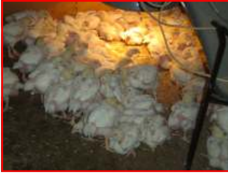
Baby Chicks at Booleroo District School—food production, sustainability and agriculture are an important aspect of teaching here. But don't worry—these aren't for eating!!!