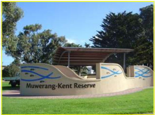
Beginning of the Ramindjeri Heritage Trail at Kent Reserve Victor Harbor. The trail continues along the coast with signage at many points that tell the story of the Ramindjeri people and the local area.