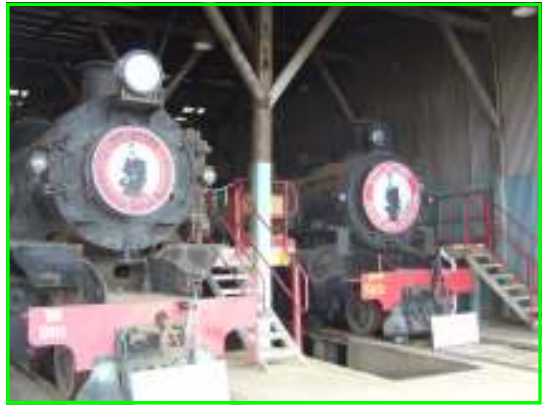
Steamtown—showcasing the history and culture of the railways in Peterborough and South Australia.