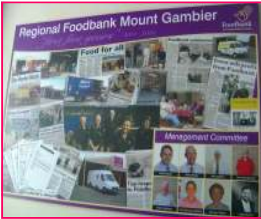
Foodbank at Mt Gambier—not only helping a huge number in the community, but saving vast amounts of good food from going to landfill. Over the past six years 450 000 kilograms of food has been distributed.